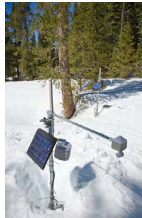
Wireless sensor node developed by the SSCZO

Funding. The SSCZO is supported by NSF's Earth Sciences Division