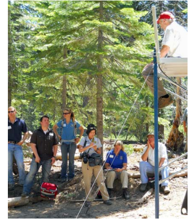
Stakeholder visit and briefing at the SSCZO

Impacts. Our research addresses fundamental knowledge gaps around management of water supplies, forests, hydropower and integrated ecosystem services. The state's water providers, forest managers and hydropower generators are planning water-information systems that build on advances at the SSCZO. Knowledge from the SSCZO is helping public agencies plan major investments in headwater-protection research and management programs. Our team has frequent dialog with resource managers, elected officials and the public on climate preparedness. Having the integrated research and multi-disciplinary team of a CZO to inform climate adaptation around water in California, over a long enough period to make an impact, is very timely, given the state's global leadership role in implementing climate solutions.